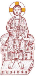
CHRIST, THE HOLY WISDOM OF GOD